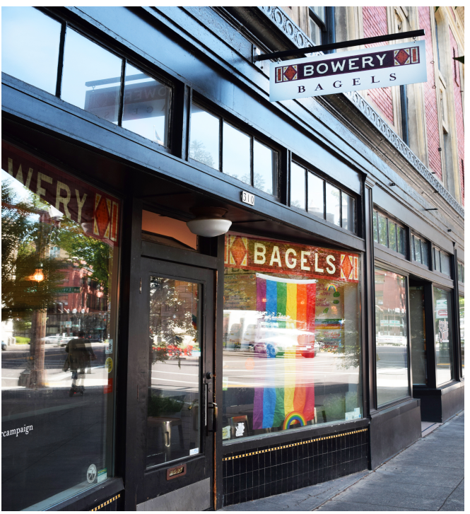
WEWORK BOWERY BAGELS