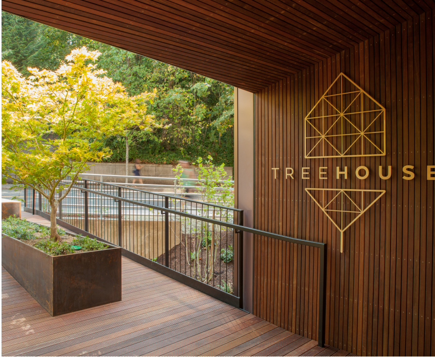
"Inspired by the natural textures and light of the surrounding forest"