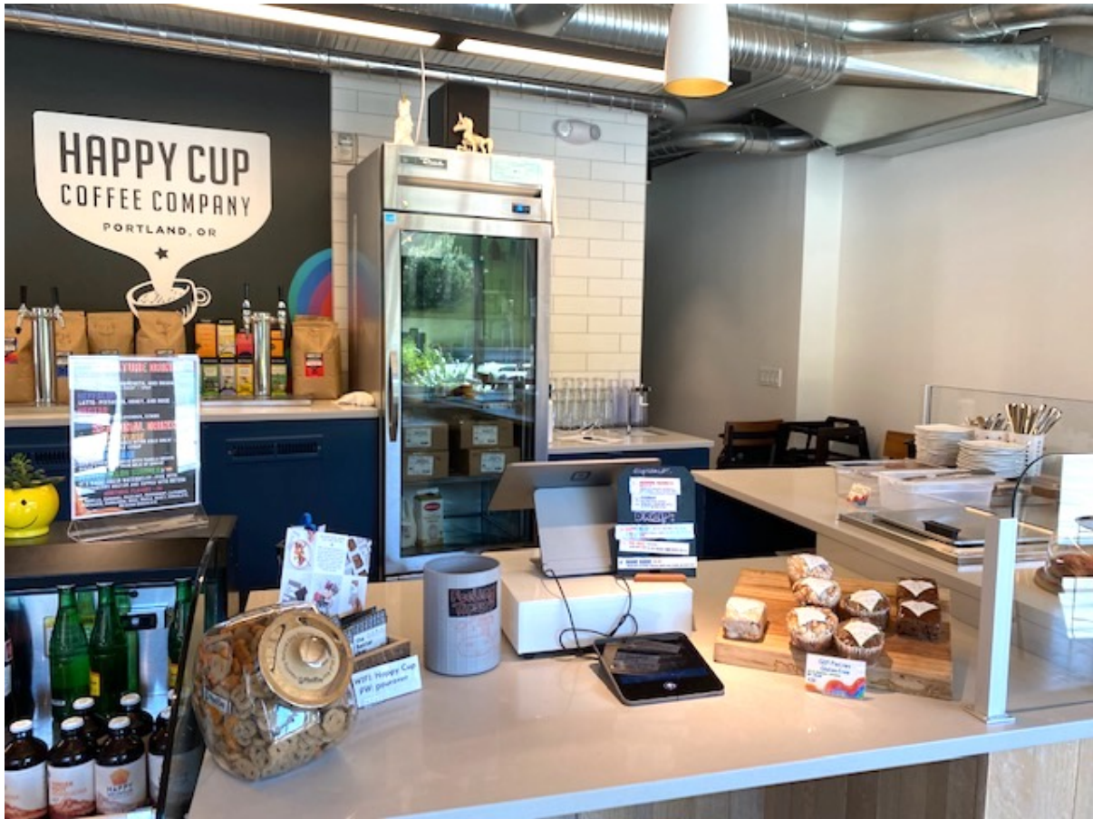
Commercial Condominium Unit 16 NE Fremont - $670,000 - 5.7% CAP